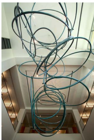
"Orbital Loops" by Joyce Cutler-Shaw

5560 Overland Avenue, Suite 270 San Diego 92123