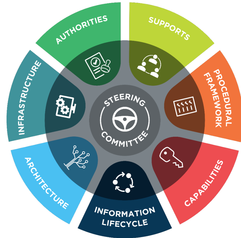
Information Governance Implementation Model 2.0